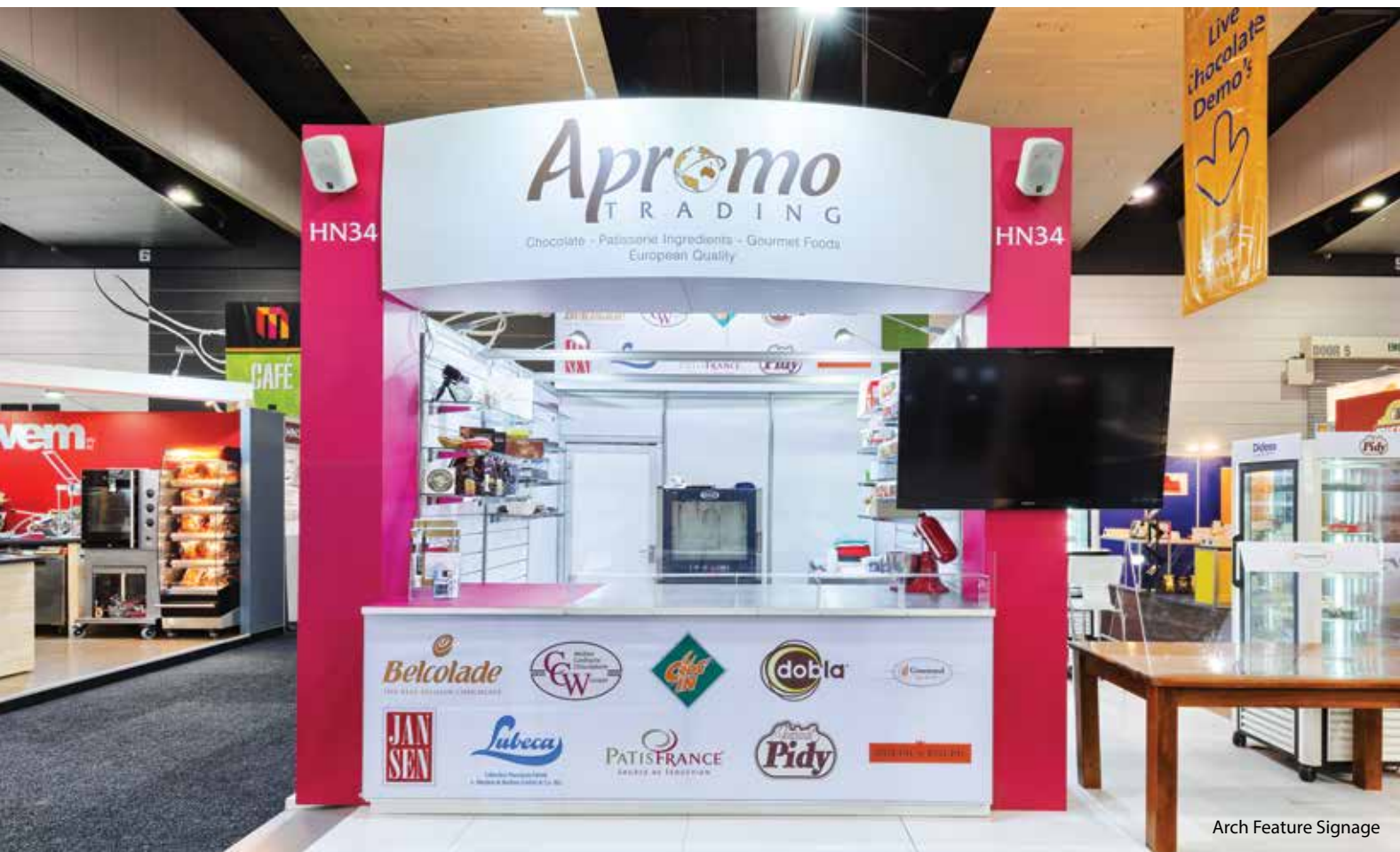
Arch Feature Signage