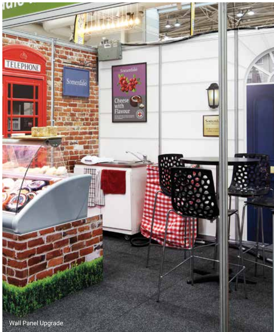
Wall Panel Upgrade