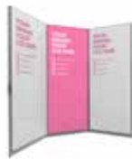
NuPod A code: podnup