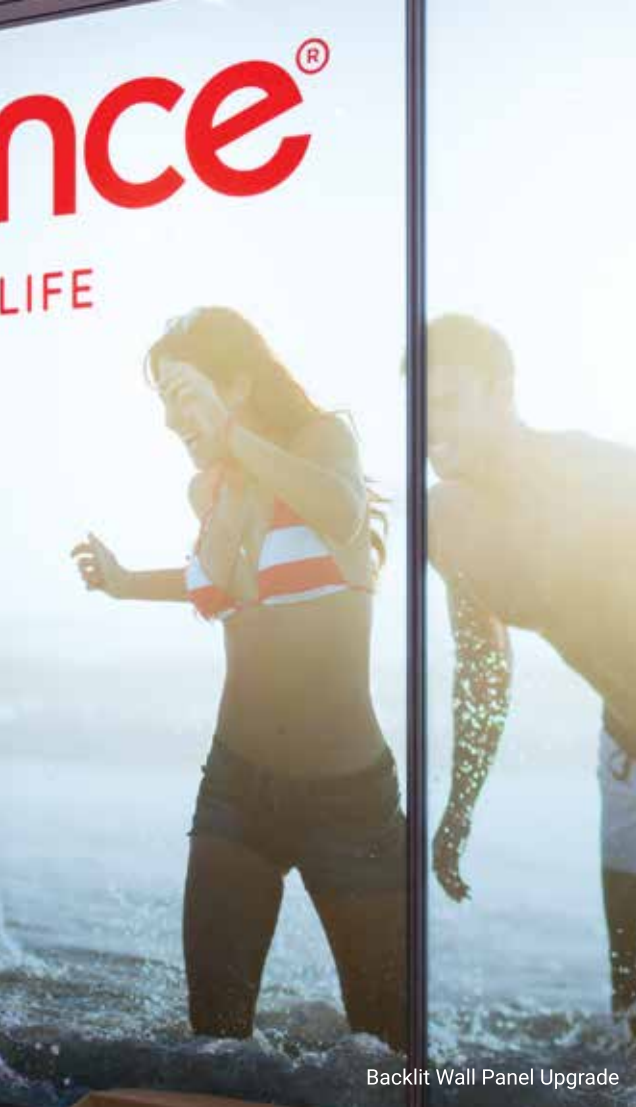
Backlit Wall Panel Upgrade