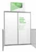
ProPod A code: podprp