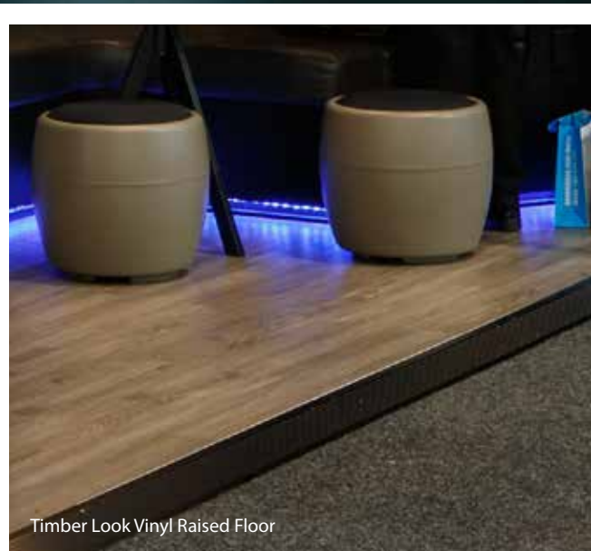
Timber Look Vinyl Raised Floor