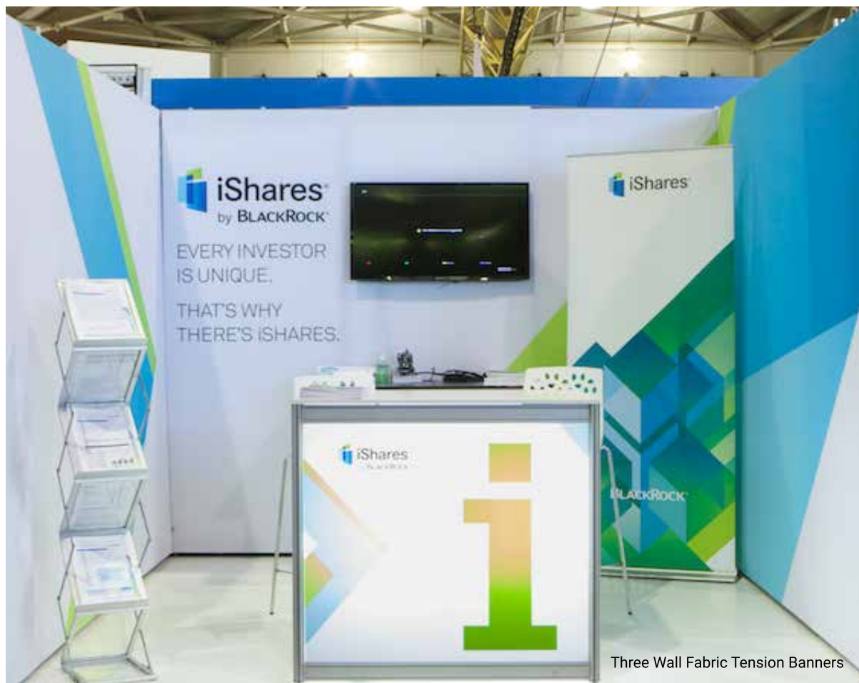
Three Wall Fabric Tension Banners