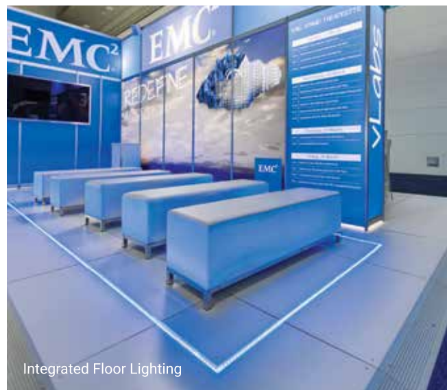
Integrated Floor Lighting