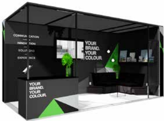
Hub Peninsula Stand – 6m x 3m