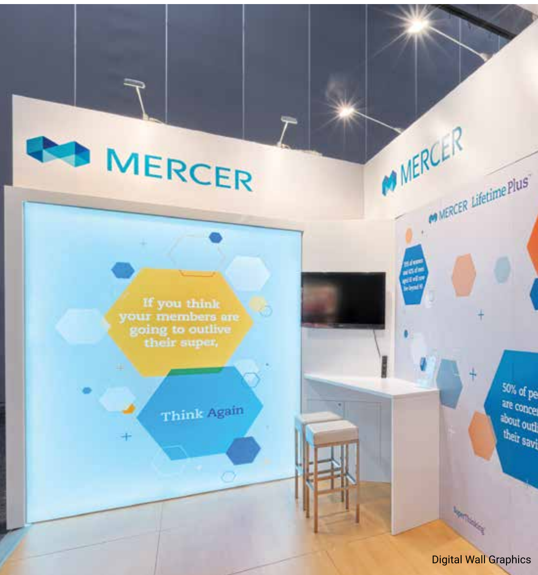
Digital Wall Graphics