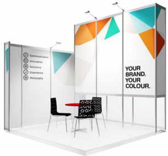
Villa Corner Stand – 3m x 3m