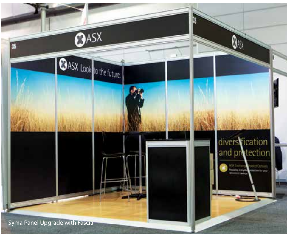
Syma Panel Upgrade with Fascia