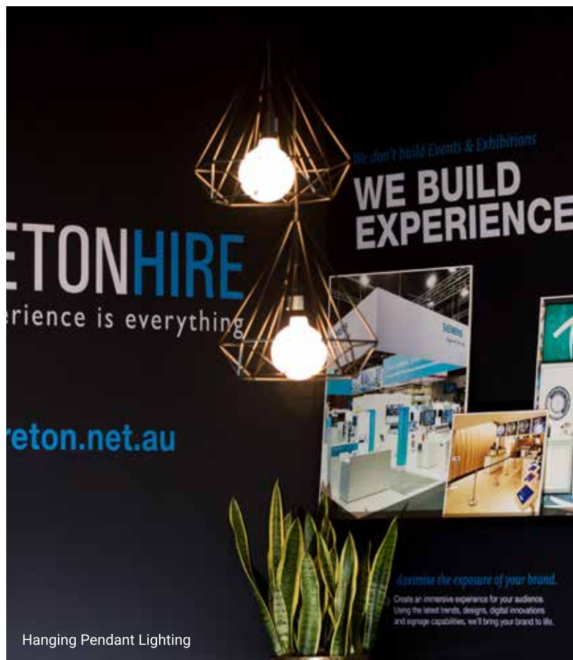
Hanging Pendant Lighting