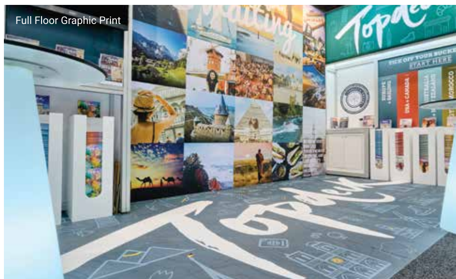
Full Floor Graphic Print