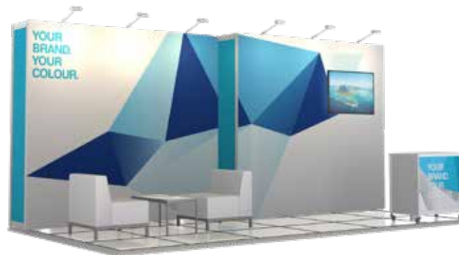
Collaborator Peninsula Stand – 6m x 3m