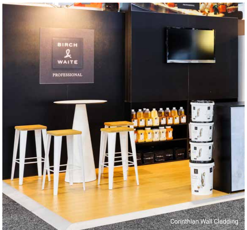
Corinthian Wall Cladding