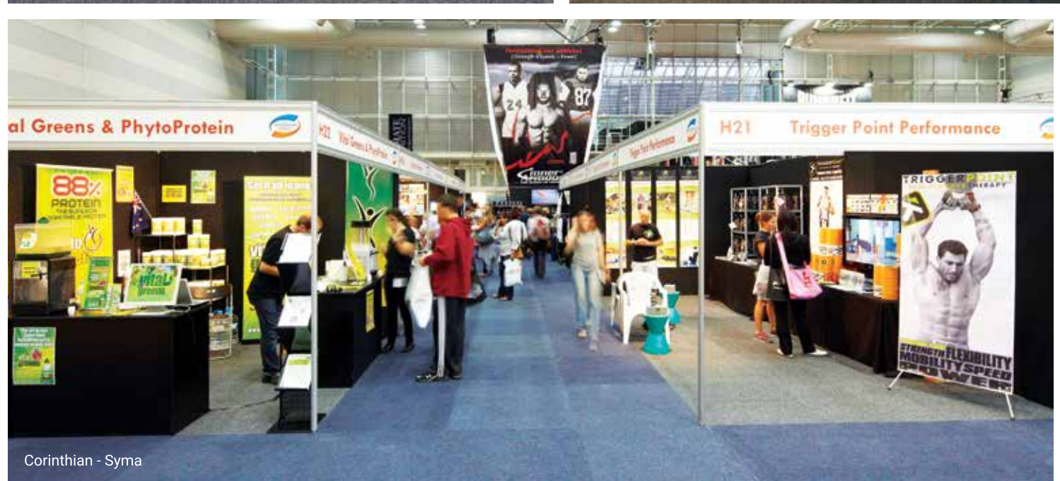
Corinthian - Syma