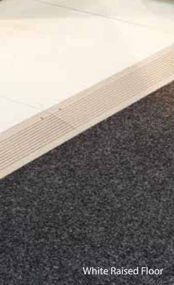
White Raised Floor