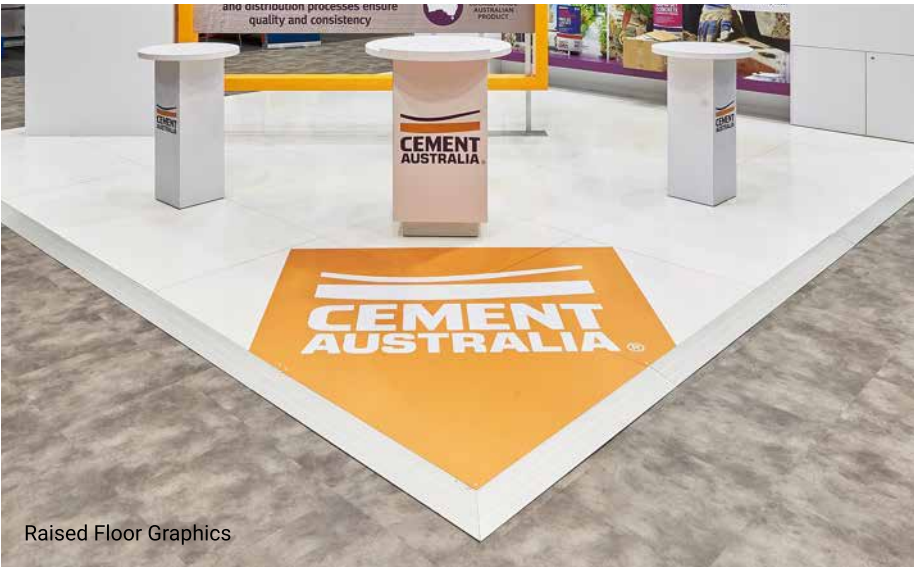
Raised Floor Graphics