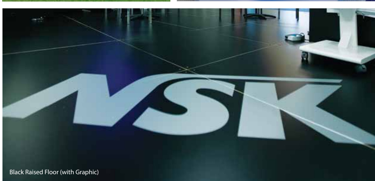
Black Raised Floor (with Graphic)