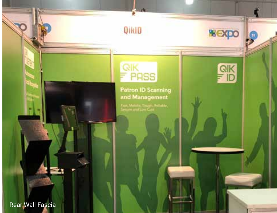
Rear Wall Fascia