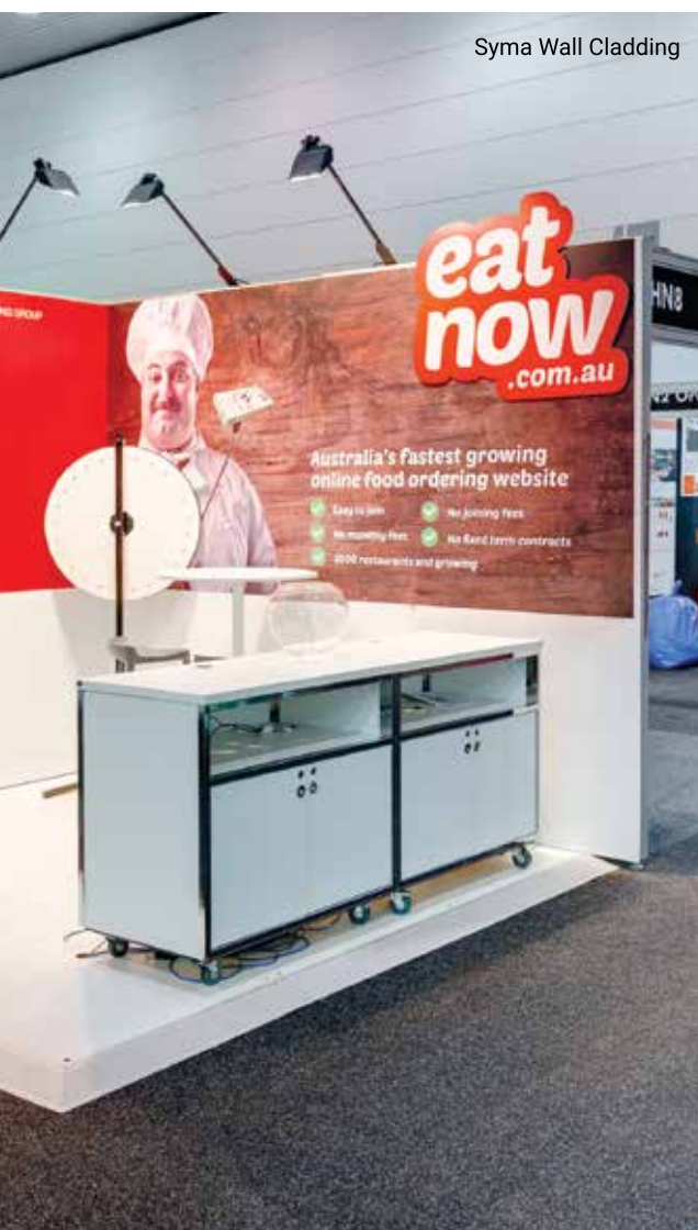
Syma Wall Cladding