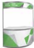
InterPod A code: podinp

Networking pods are a cost efficient way to get multiple suppliers or touch-points, into a smaller space. The Moreton Hire pod designs are examples of concise business spaces to optimise your floor space. Contact the team today to enquire about our range of networking pods.