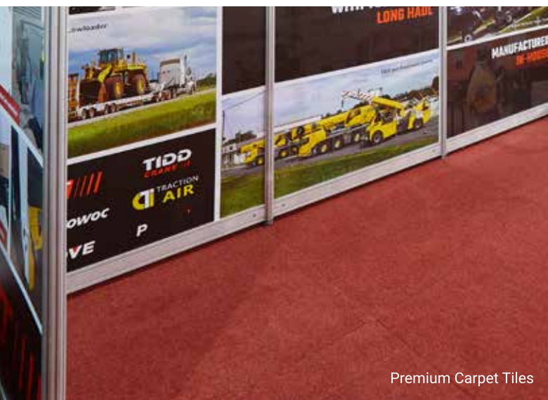
Premium Carpet Tiles

We offer a variety of options to suit your needs, from high quality carpet tiles and broadloom carpet to timber look vinyl and raised flooring.