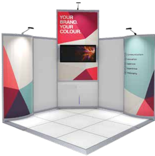
Olympus Corner Stand – 3m x 3m