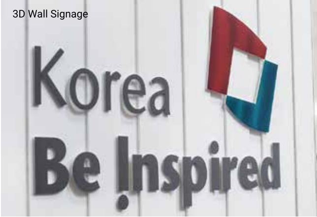
3D Wall Signage