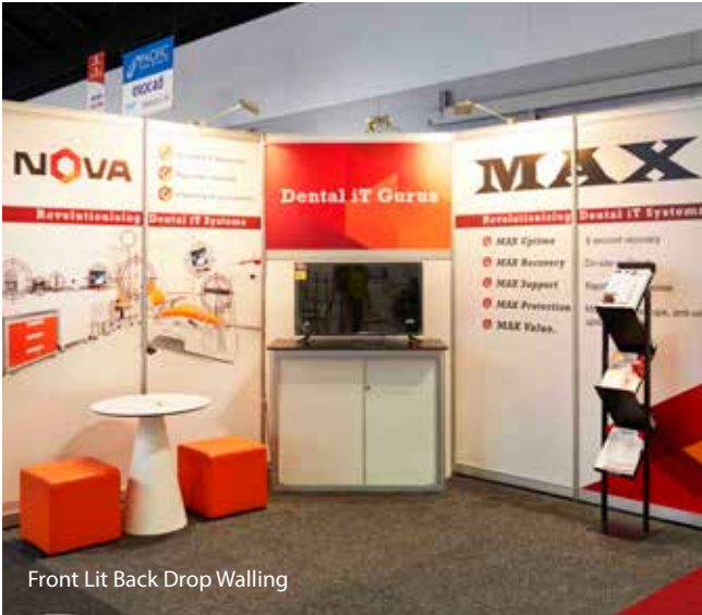
Front Lit Back Drop Walling