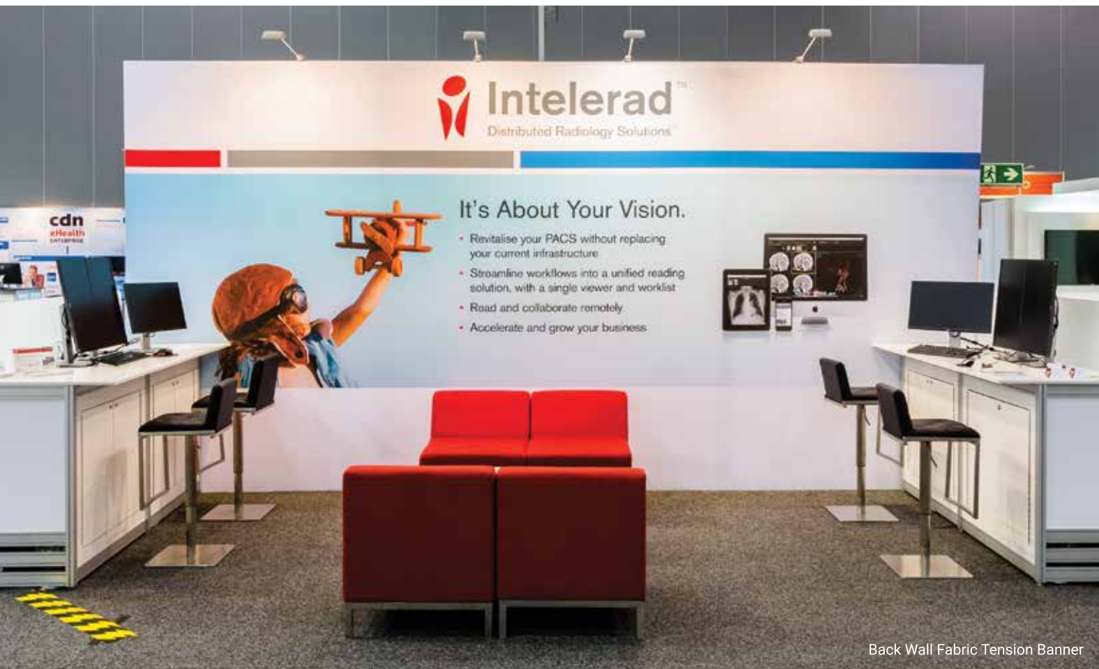
Back Wall Fabric Tension Banner