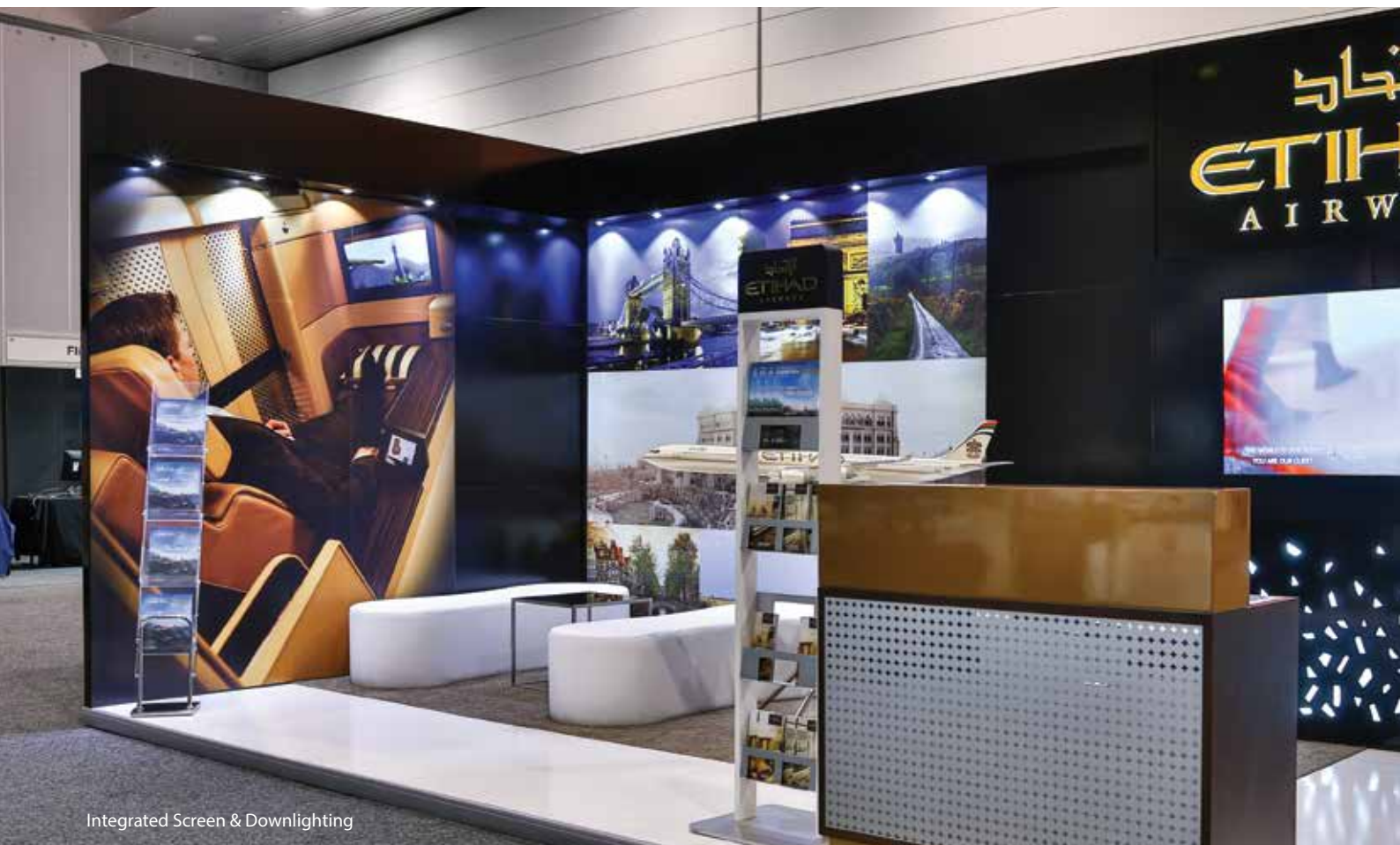
Integrated Screen & Downlighting