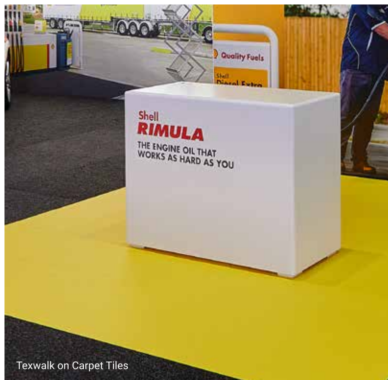
Texwalk on Carpet Tiles