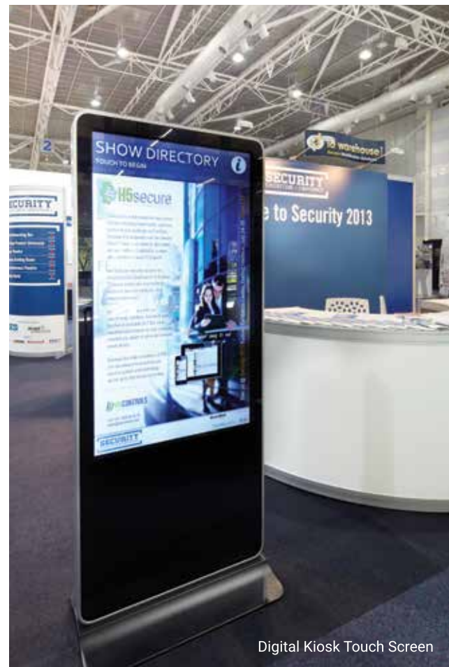
Digital Kiosk Touch Screen