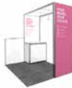
UniPod A code: podunp