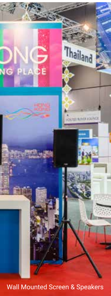
Wall Mounted Screen & Speakers