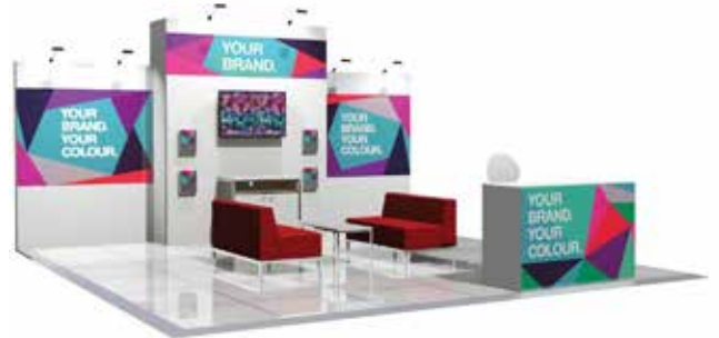
Fraser Peninsula Stand – 6m x 6m