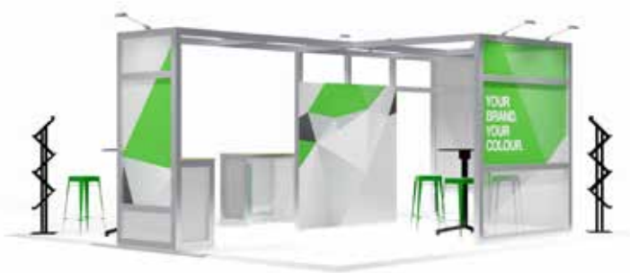
Utfor Island Stand – 6m x 6m