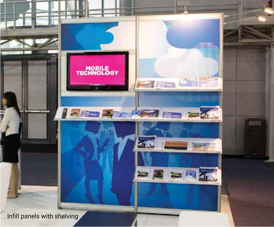
Infill panels with shelving