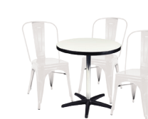
Tolix Package 1 $221 code: fftp1