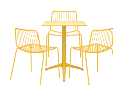
Nolita Package 1 $307 code: fpnop1