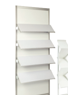
Shelving Package 1 $250 code: fpshp1