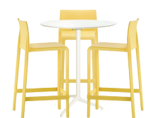
Volt Package 2 $350 code: fpvop2