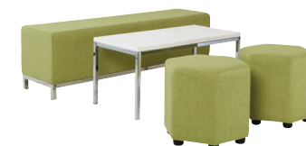
Lucca Package 1 $419 code: flp1