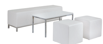
Leatherette Package 1 $294 code: fplolp1