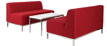
Lucca Package 3 $598 code: flp3