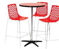
Spring Package 2 $294 code: fpspp2