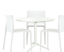
Volt Package 1 $259 code: fpvop1