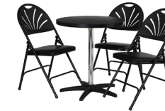
Atlanta Package $122 code: fpap1