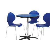
Poly Vogue Package 1 $122 codes: fppvp1