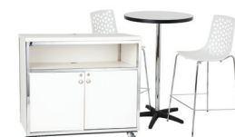
Quattro Cupboard Package 1 $400 code: fpqcp1