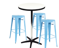
Tolix Package 2 $225 code: fftp2