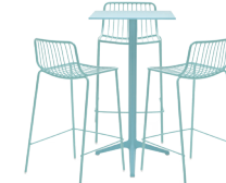
Nolita Package 2 $345 code: fpnop2