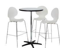
Poly Vogue Package 2 $177 code: fppvp2