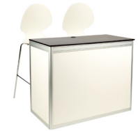
Mode Cupboard Package $274 code: fpmp1