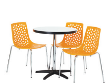
Spring Package 1 $150 code: fpspp1