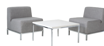
Lucca Package 2 $502 code: flp2