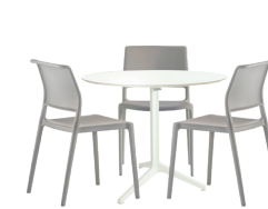
Ara Package $221 code: fparp1

For your convenience we have put together our most effective furniture packages suited to a wide range of purposes.