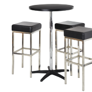
Club Package $177 code: fpcsp1